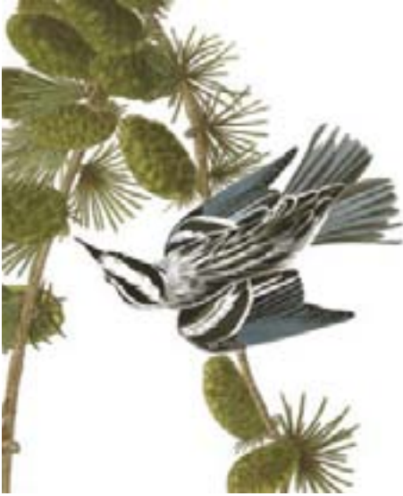
Black and White Creeper, now called the Black-and-white Warbler. Illustration by John James Audubon.

This nimble and expert little species seldom perches on the small twigs; but circumambulates the trunk, and larger branches, in quest of ants and other insects, with admirable dexterity. It arrives in Pennsylvania, from the south, about the twentieth of April, the young begin to fly early in July; and the whole tribe abandon the country about the beginning of October. Sloane describes this bird as an inhabitant of the West India islands, where it probably winters. It was first figured by Edwards from a dried skin sent him by Mr. William Bartram, who gave it its present name. Succeeding naturalists have classed it with the warblers; a mistake which I have endeavored to rectify.