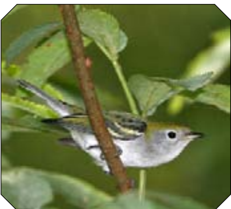
Chestnut-sided Warbler (Fall)

Wintering passerines will have settled in to the refuge and ducks should start arriving. This is always an interesting trip. We are never sure what we will find. Since folks come from all corners of the Charlotte area, we will meet at 8:30 AM at the bathrooms (main entrance off of Rt. 52) instead of trying to car pool. Bring a lunch as well.