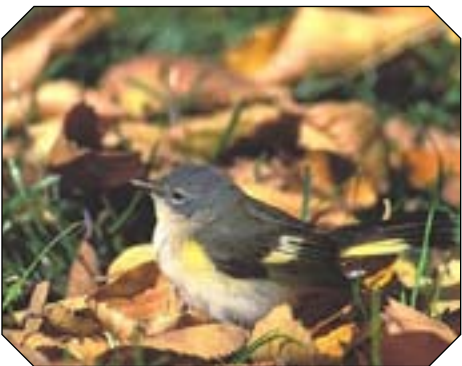
American Redstart (Fall)

We will be investigating the University Park area of this greenway. Migrants should be moving through this greenway with a mix of open and wooded areas along the creek. Meet at the corner of Governor Hunt Rd. and David Taylor Rd.